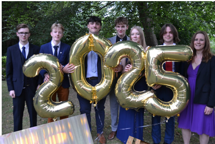
Sixth form team

Class of 2025 - you will be missed, thanks for everything, be good and stay in touch.